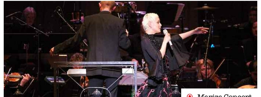
📍 Mariza Concert