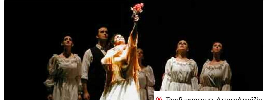
📍 Performance AmarAmália